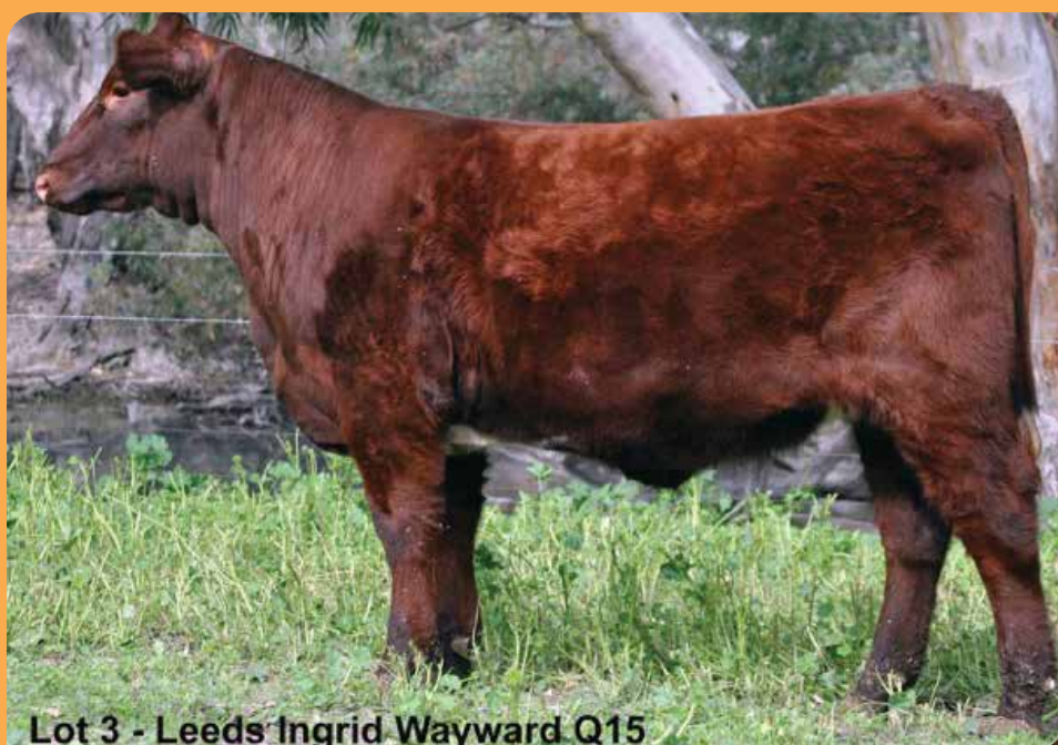
Lot 3 - Leeds Ingrid Wayward Q15