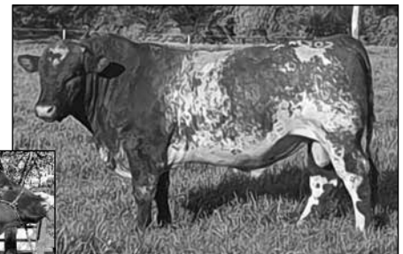
SIRE: OUTBACK SPRYS BUDDY M302