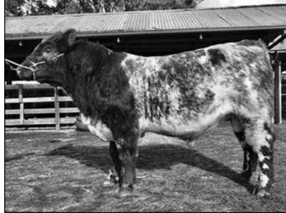
SIRE: CASKIEBEN CONDAMINE M59

GLEN HUON XTRA FIG JAM CASKIEBEN FANCY 31ST CASKIEBEN FANCY 25TH