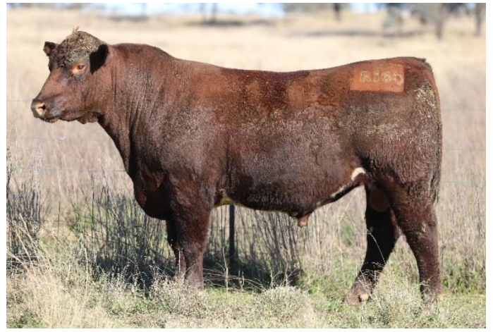
Lot 20 - PGCR160