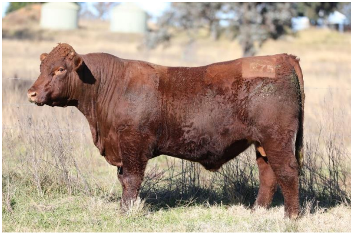
Lot 7 – PGCR75