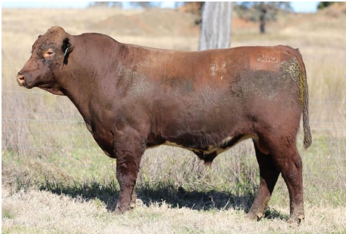
Lot 8 – PGCR15