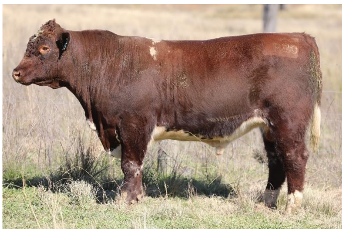
Lot 31 – PGCR20