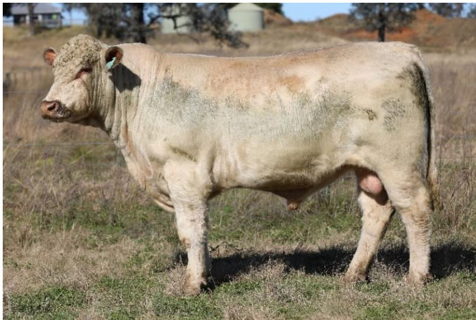
Lot 17 - PGCR28