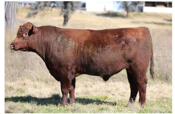
Lot 22 - PGCR67