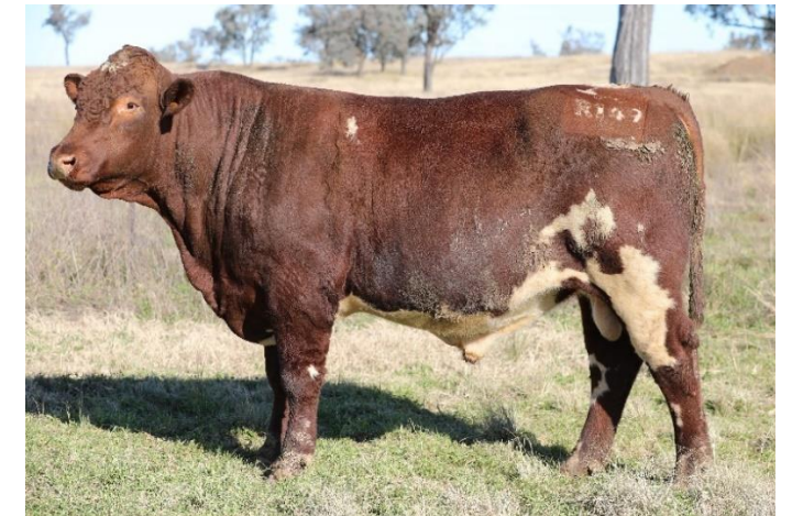
Lot 24 - PGCR149