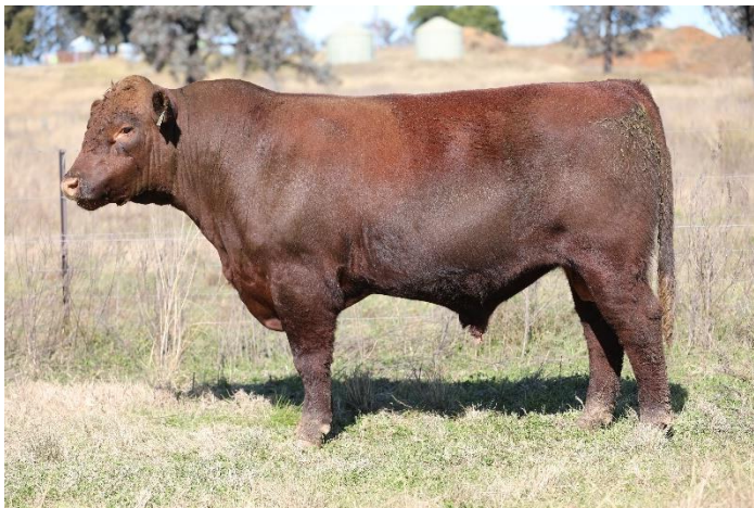
Lot 10 - PGCR68