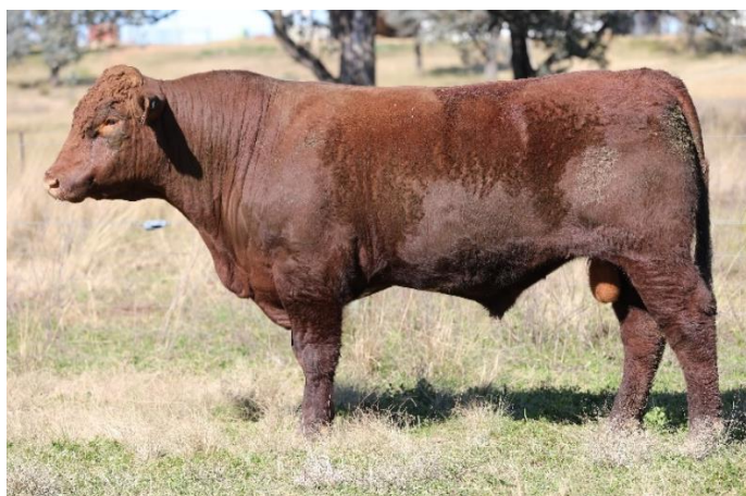
Lot 39 – PGCR51