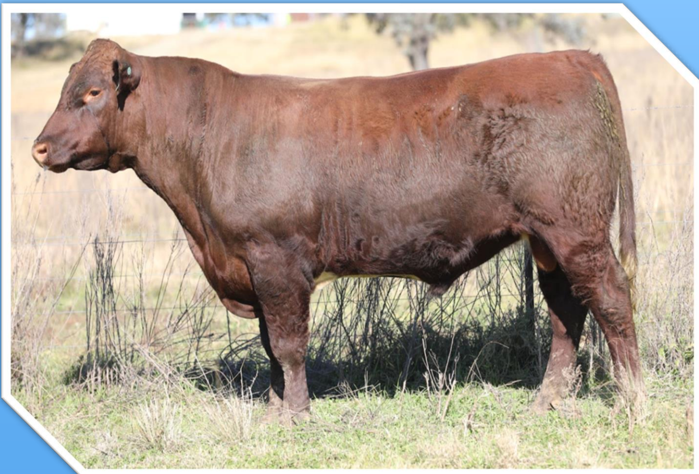
★ Lot 33 ~ PGCR103 ~ Bungulla Lyndon R103 ★