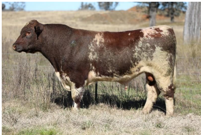
Lot 16 - PGCR73