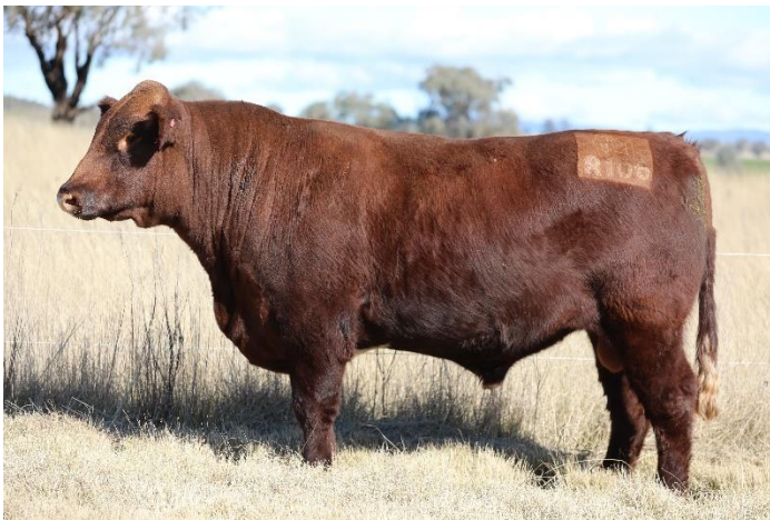
Lot 25 - HSER106