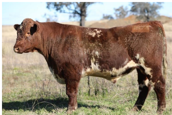
Lot 32 – PGCR173