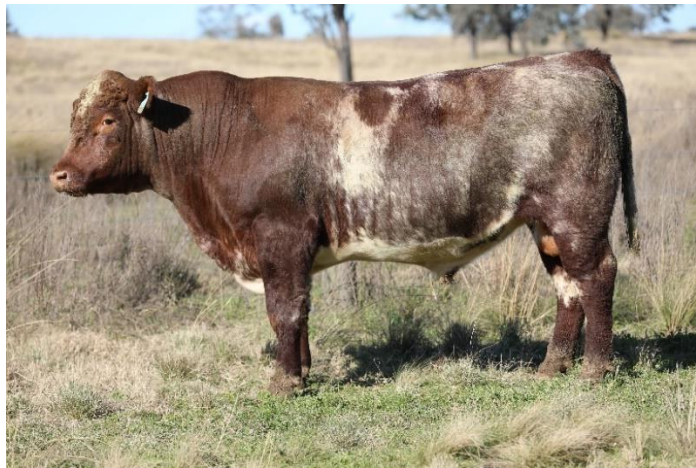
Lot 18 - PGCR132