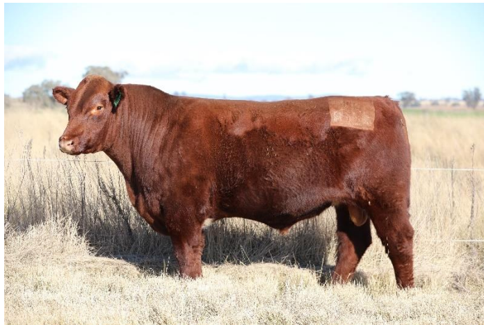
Lot 14 - NLRR114