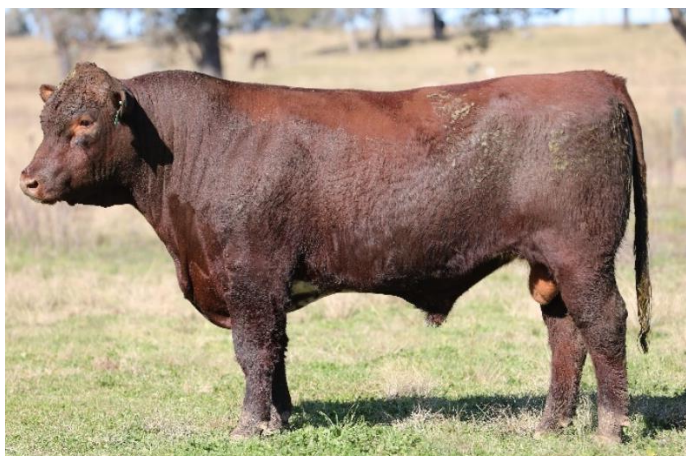
Lot 37 – PGCR86