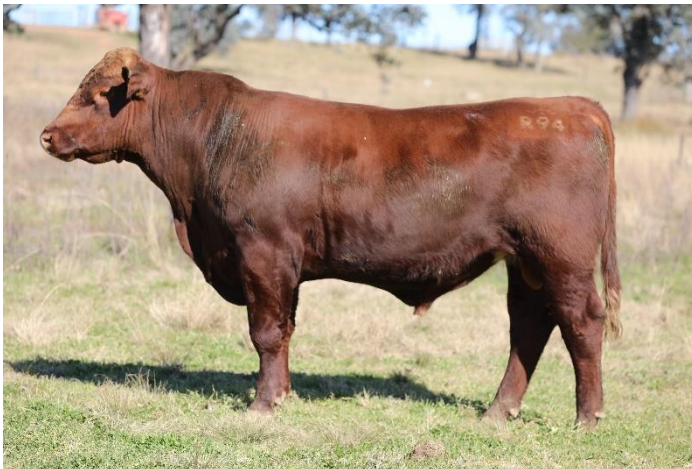
Lot 23 - PCGR94