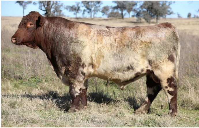
Lot 2 – PGCR137