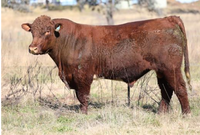
Lot 9 – PGCR83