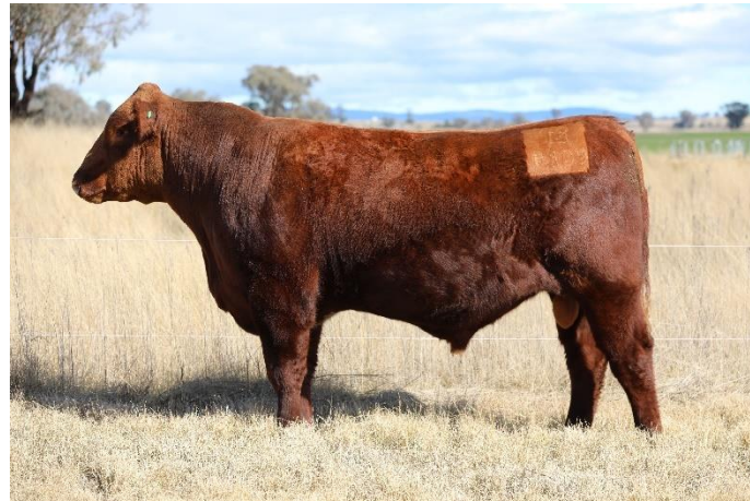
Lot 30 – LWER109