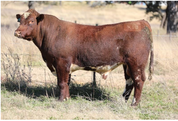
Lot 19 - PGCR18