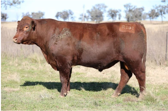
Lot 5 – PGCR151