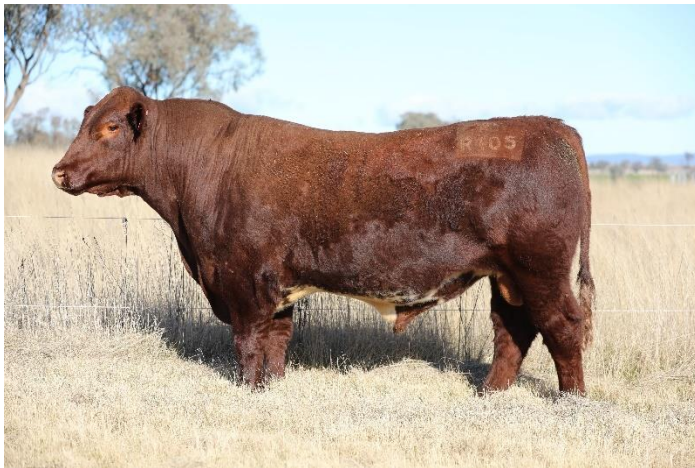
Lot 13 - HSER105