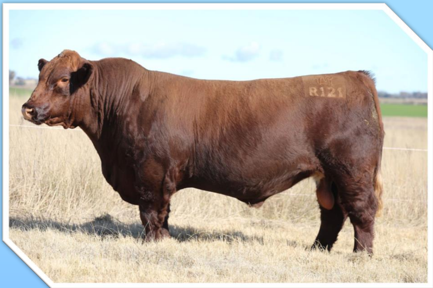
★ Lot 12 ~ NLR121 ~ Nagol Park PB Rum R121 ★