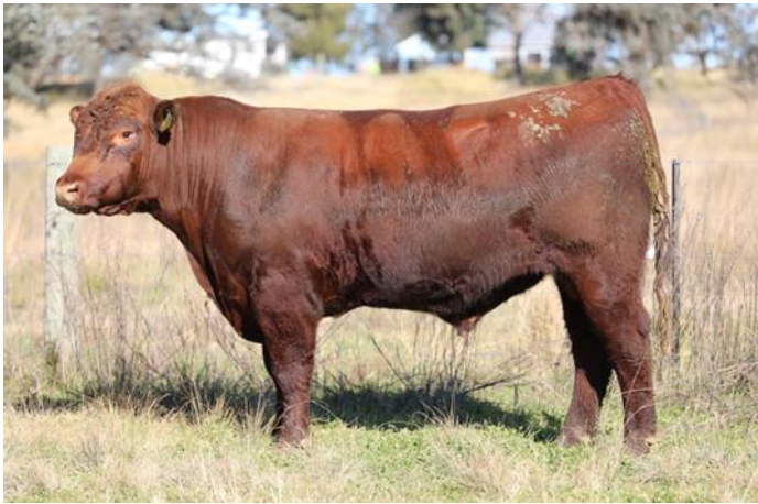
Lot 6 – PGCR79