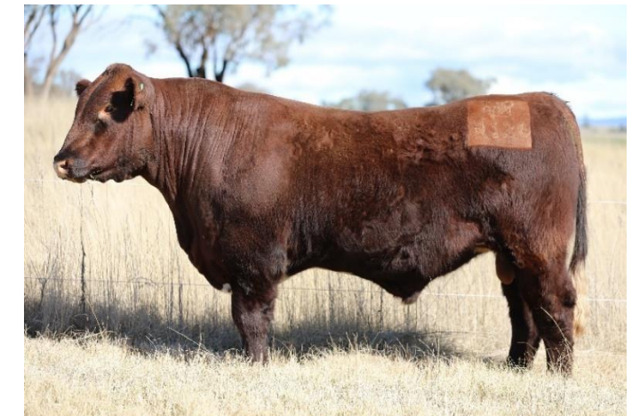
Lot 26 - NLRR126