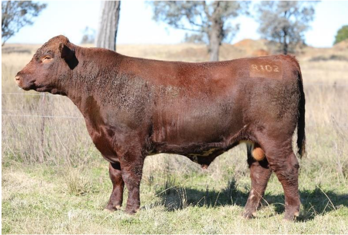
Lot 21 - PGCR102