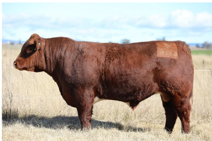
Lot 28 – NLRR113