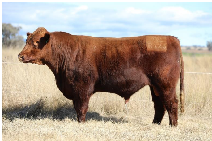
Lot 27 – NLRR123