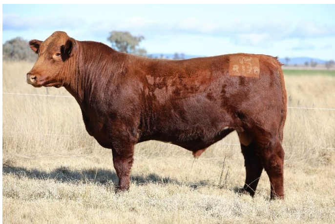
Lot 29 – NLRR128