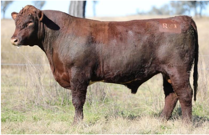
Lot 1 – PGCR81