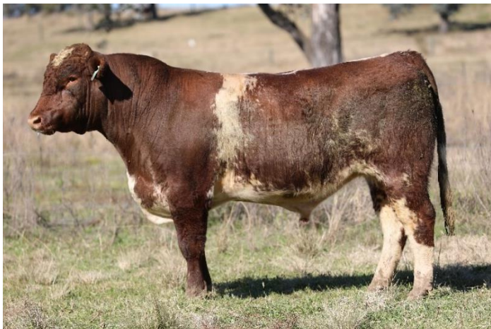
Lot 15 - PGCR80