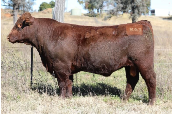
Lot 3 – PGCR63