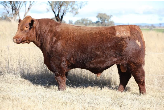
Lot 11 - NLRR102