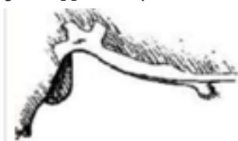
A score of 1 is tight

Sheaths are also scored from 1 to 5 with 2 being ideal for most bulls. Temperament scores are also taken and provide a good opportunity to assess temperament whilst animals are being handled individually.