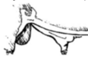
A score of 5 is loose

It is important to understand that very few animals are ever ideal for all traits and that some variation is more than acceptable and should not be seen as devaluing an animals' potential worth.